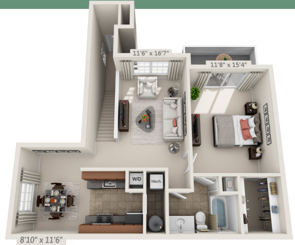
MAPLE II: 1 Bedroom/1 Bath • 862 sq ft