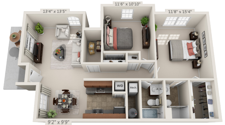
HOLLY: 2 Bedroom/2 Bath • 935 sq ft